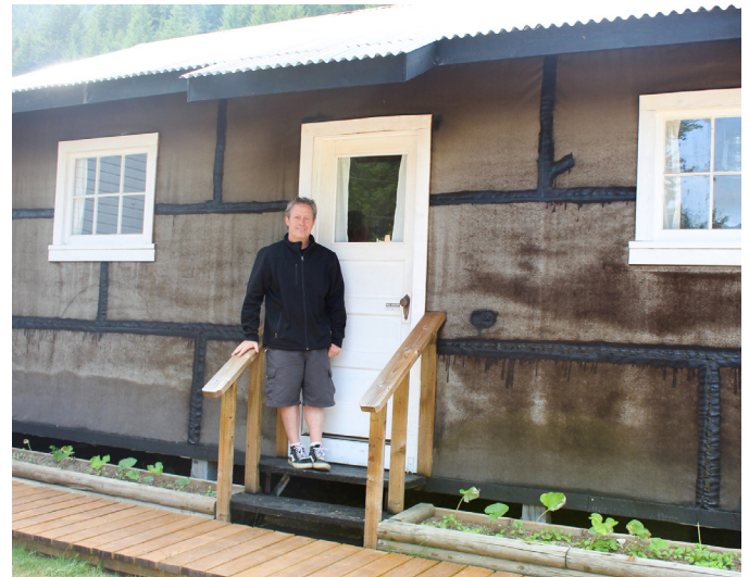
Trust staff worked closely with the Sunshine Valley Tashme Museum team (BC), participants in Canada Historic Places Day and winners of a Launch Pad Coaching Grant.

Central to the National Trust's mission is empowering the passionate and hardworking grassroots volunteers and organizations who own or operate Canada's historic sites and special places — because we know they are essential to resilient, creative, and inclusive communities. This year we ramped up the volume on Trust programs under the Regeneration Works banner, which were already embracing remote and online delivery long before lockdowns and travel restrictions came into effect. We are especially proud of Launch Pad — an innovative approach to online long-distance coaching that delivers game-changing support to volunteers and staff who are grappling with the challenges of