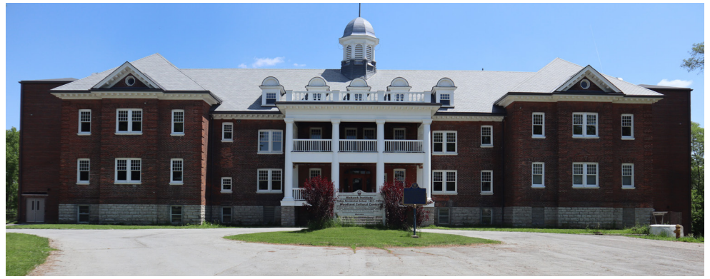
The Woodland Cultural Centre (Brantford, ON) joins the Trust's network of Passport Places. The Centre (which includes the former Mohawk Institute Residential School) preserves and promotes Indigenous history, art, language and culture.

Staff hosted a 'behind the scenes' personal tour for Trust donors in September, and we were the first National Trust to offer a free virtual visit of the completed project to an international audience of National Trust members in December — kicking off our participation in the INTO Places reciprocal visiting program that will give our members free access to thousands of properties around the world. Here in Canada, we are proud to provide marketing and support to 50 more Passport Places added to our network this year —