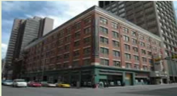
Laughed Block, Calgary, AB

A federal program designed to test the appetite for a similar program saw $21.5 M in federal contributions leverage 8 times in private investment ($177 M)