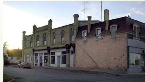
McNaughton Building, Mossman, SK